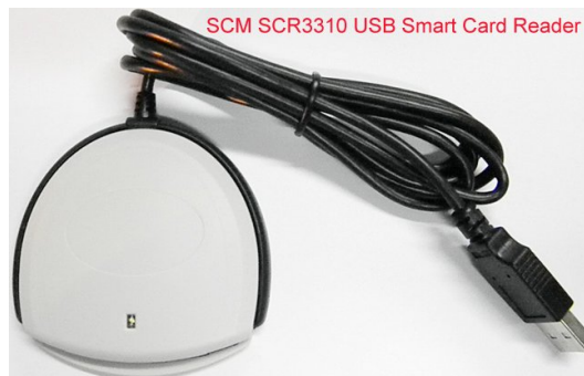
Figure 3: SCR3310 USB CCID Smart Card Reader

sysmocom offers a suitable USB CCID compliant card reader at http://shop.sysmocom.de/products/scr3310