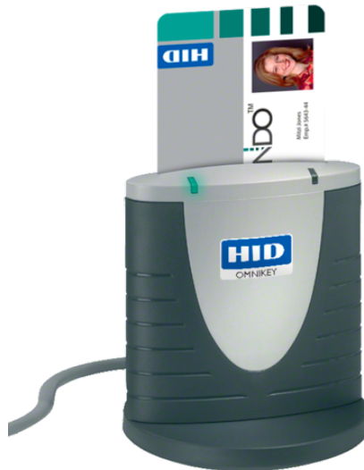
Figure 3: Omnikey CardMan 3121 USB CCID Smart Card Reader