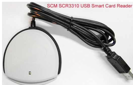
Figure 3: SCR3310 USB CCID Smart Card Reader

sysmocom offers a suitable USB CCID compliant card reader at http://shop.sysmocom.de/products/scr3310