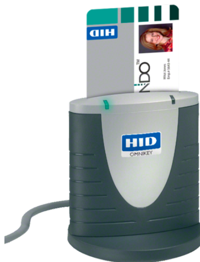
Figure 3: Omnikey CardMan 3121 USB CCID Smart Card Reader

sysmocom offers suitable USB CCID compliant card readers at http://shop.sysmocom.de/t/sim-card-related/card-readers